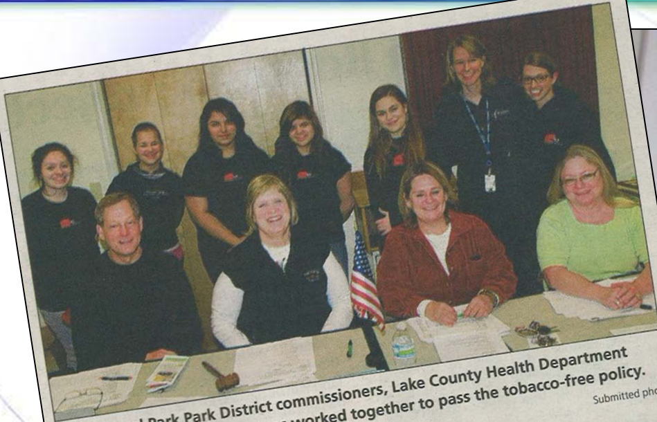
Grandwood Park Park District commissioners, Lake County Health Department staff and REALITY Illinois teens worked together to pass the tobacco-free policy.