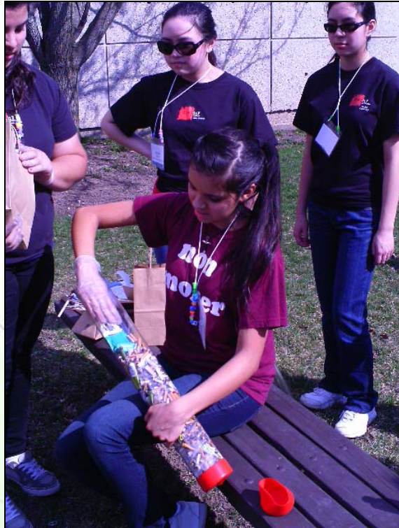
Tobacco litter clean ups