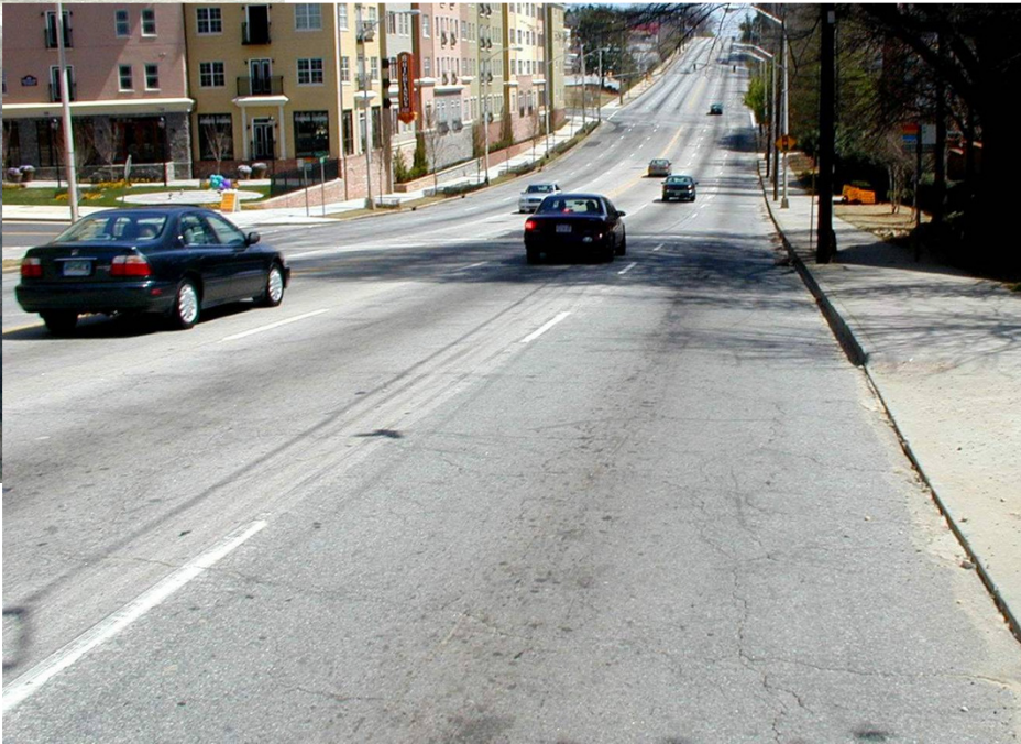
What the driver sees