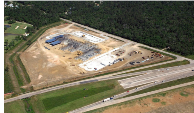
Remotely Located School