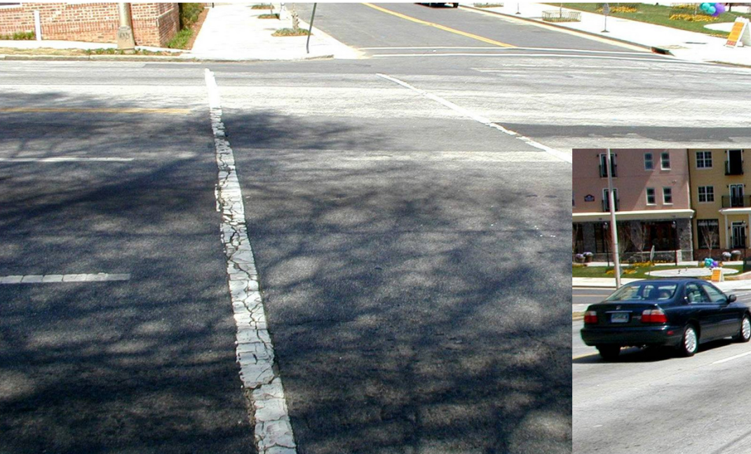
What the pedestrian sees