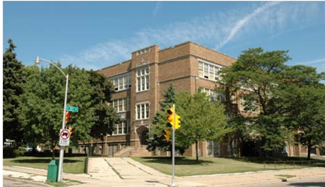
Community Centered School