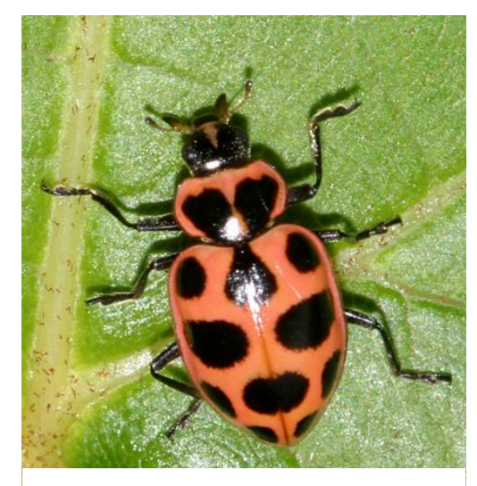
Convergent Lady Beetle

The Asian lady beetle is also known as the multicolored Asian lady beetle because its color varies from pale yellow to red-orange. Most