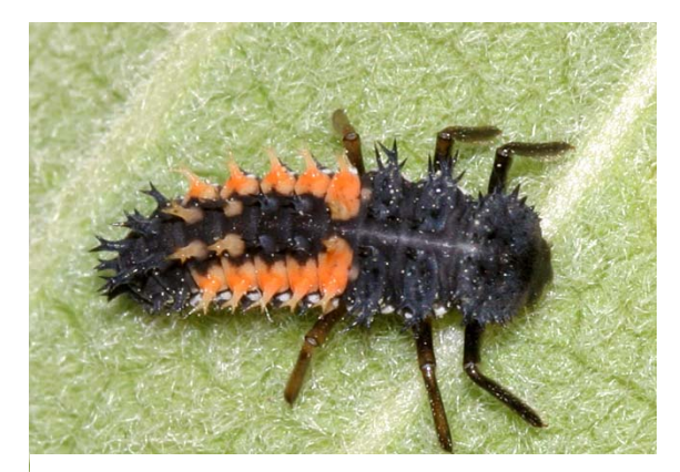
Asian Lady Beetle (Larva)

As the Asian lady beetle is a tree-dwelling species that naturally spends the winter in the cracks and crevices of cliffs, multi-story homes and homes on hills near wooded areas are likely to be invaded in the fall. Lady beetles will often settle down for the winter beneath siding and shingles, in attics, soffits, porches, garages, wall voids, window and door frames. Owners of homes at risk should seal these harborages when practical. Properly timed, preventive