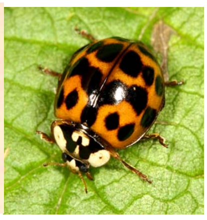
Multicolored Asian Lady Beetles (Note Variation in Color and Markings)