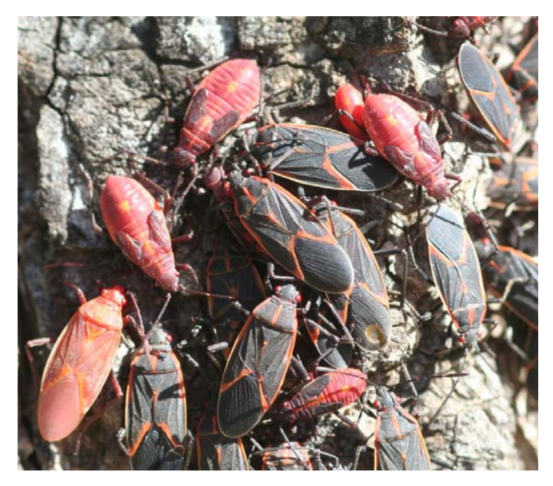
Boxelder Bugs (adults and nymphs)

Long, warm autumns and mild winters give rise to large populations of boxelder bugs in spring. Warmed by the structure's heat, the bugs emerge sluggishly on warm days in late winter or early spring to seek their favorite food, juices from leaves, twigs and seeds of seed-bearing boxelder trees.