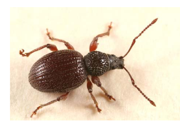
Strawberry Root Weevil