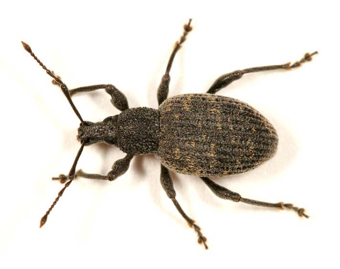
Black Vine Weevil

Adults of common species cannot fly but occasionally crawl onto and into structures in summer and fall, apparently seeking