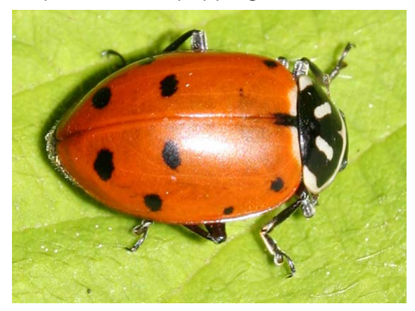
Spotted Lady Beetle

There are several home-invading species; round or oval-shaped beetles, about one-fourth of an inch long, yellow to red in color with black spots. One native species that often enters homes is the spotted lady beetle ( Coleomegilla fuscilabris ). It